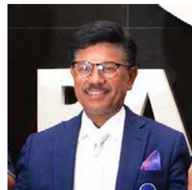
Johnny G. Plate (Minister of Communication and Informatics, Indonesia)

Digital transformation must be realized through the development of digital infrastructure and digital talent, as well as the formulation of supporting policies. As part of the Internet Governance ecosystem, Ministry of Communication and Informatics always considers aspirations, and even seeks the involvement of other stakeholders in carrying out its policies. Indonesia is open to collaborating to discuss international data protection and proposes four principles to be adopted in cross-border data flow such as: lawfulness, fairness, transparency, and reciprocity in order to create a safe and productive digital ecosystem. We welcome a wide range of stakeholders in policy making, through public consultations, public discussions and public communications, including on international platforms.